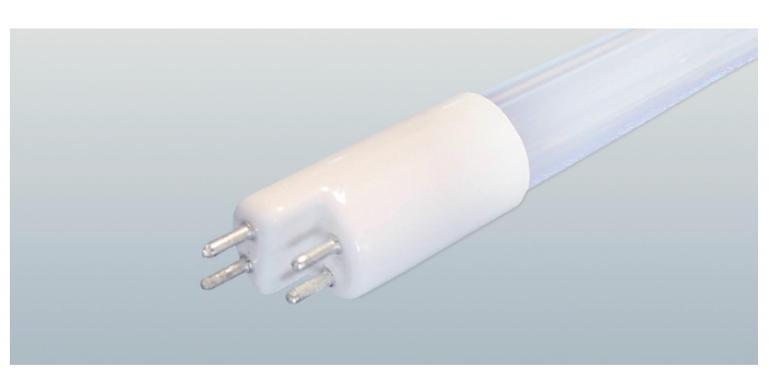
Spare lamp with stepped base