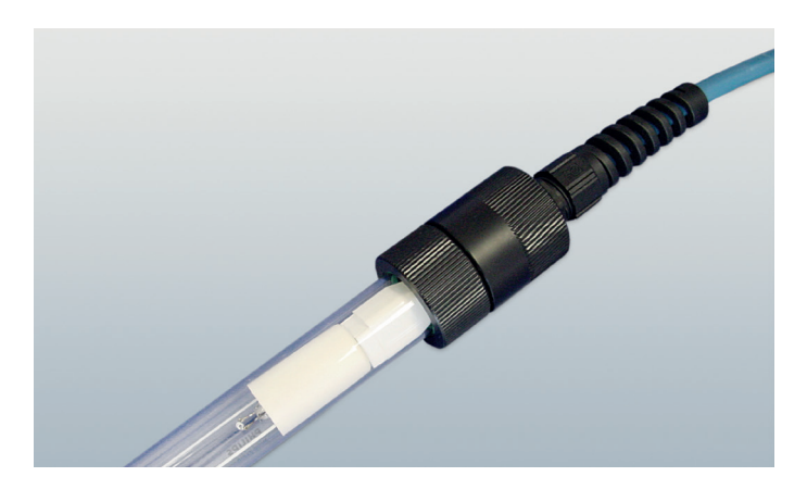
TLSVG 23 with plastic flange

Thanks to the individual production of our TRS / TLS solutions, the systems can be selected to the respective application. There is a suitable immersion system for each of our UV lamps.